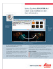
Leica Cyclone REGISTER