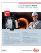
Leica ScanStation P30/40

Illustrations, descriptions and technical specifications are not binding. All rights reserved. Printed in Switzerland – Copyright Leica Geosystems AG, Heerbrugg, Switzerland 2015. 835467en-us – 03.15 – INT